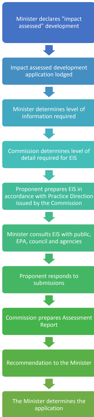
Figure 1. Steps in impact assessed development application process